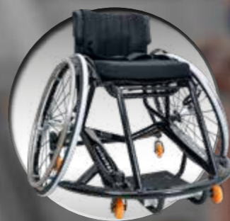
BASKET & HANDBALL