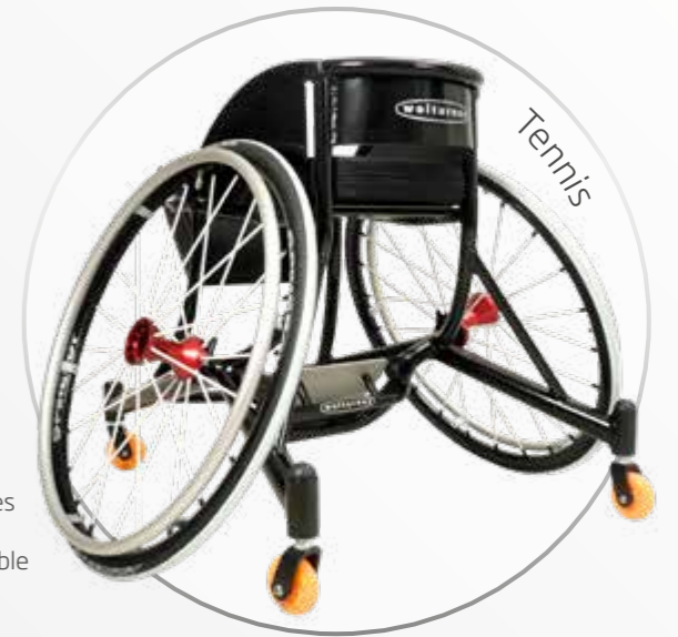
▲ Tennis wheelchair with four wheels, fully welded rear axle, welded double anti-tip, and angle-adjustable knee support.