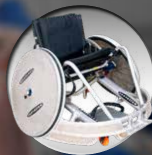
RUGBY ATTACK & DEFENCE