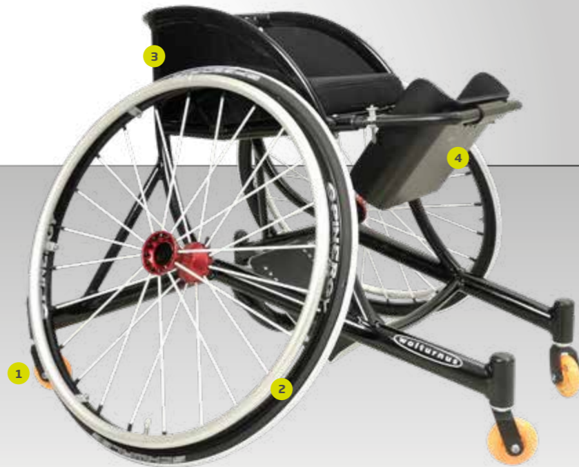
▲ Tennis wheelchair with four wheels, fully welded rear axle, welded double anti-tip, and angle-adjustable knee support.

The knee support can be designed according to your individual needs and requirements.