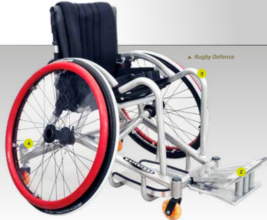
▲ Rugby Defence

Fully welded anti-tip supports for maximum stability on the court.