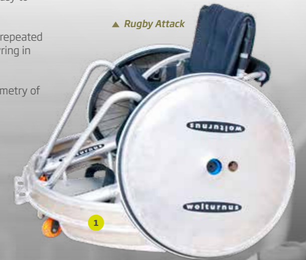
▲ Rugby Attack

Both models are customised to suit the individual player and the geometry of the frame is adapted to suit your strength, size and playing position.