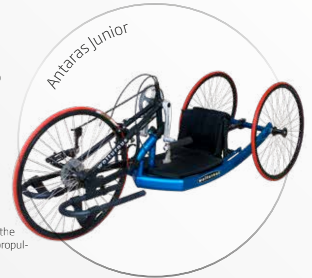
▲ Antaras Junior Adjustable handbike for children and teenagers that can meet the changing needs of young athletes. Weight from 11.5 kg.

The users can choose between a wide range of powder-coatings for the frame, which makes the surface resistant to scratching, flaking, and corrosion and very easy to maintain.