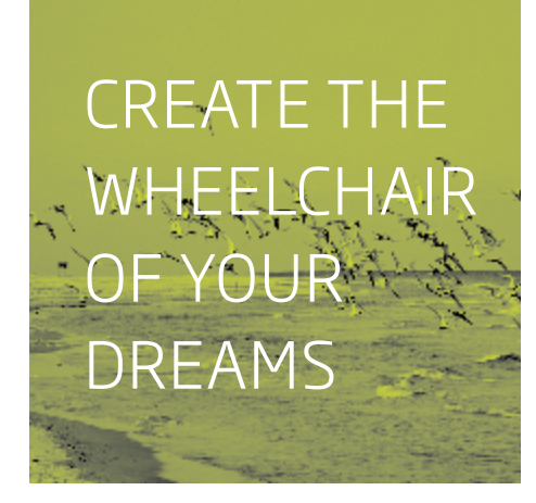
to "spice up" your front forks, sideguard poles, back brackets and footrest tubes