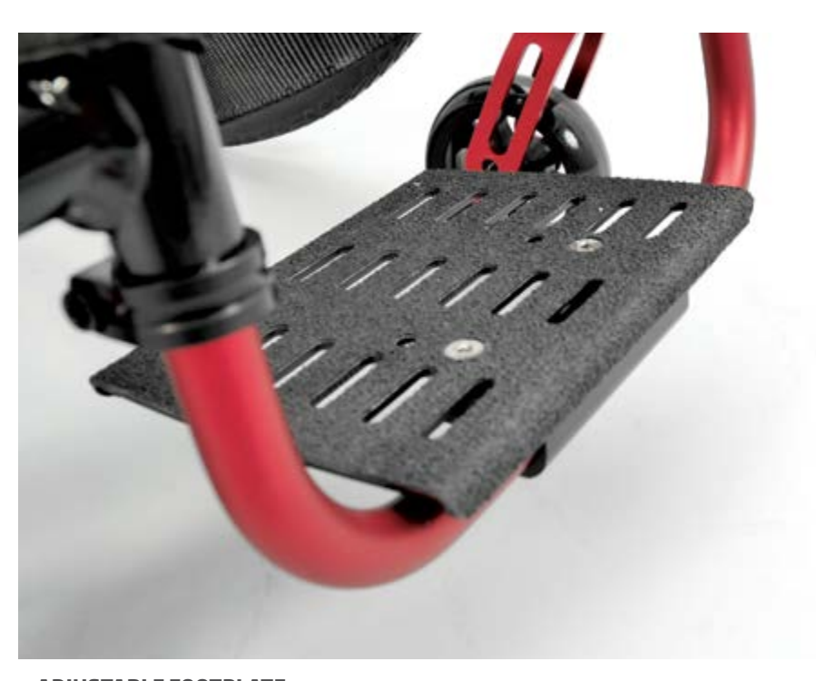
> ADJUSTABLE FOOTPLATE

An ultralight and elegant footplate, with adjustable height and adjustable angle, as well as anti-slip coating.