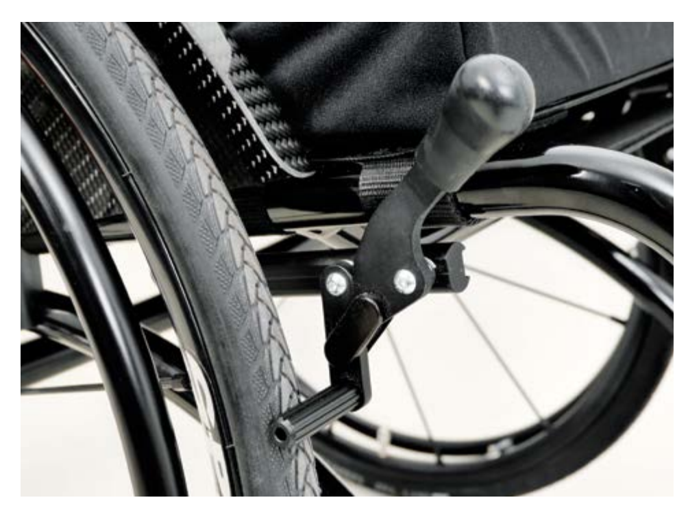
> PUSH WHEEL LOCKS

An ultralight and elegant footplate, with adjustable height and adjustable angle, as well as anti-slip coating.