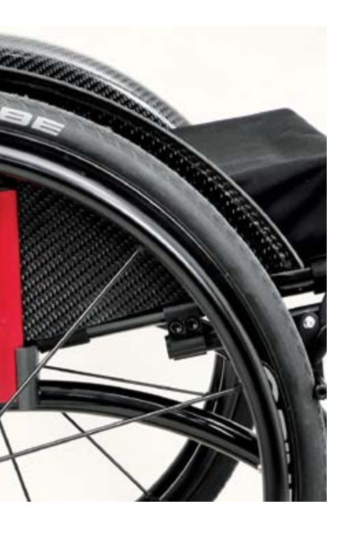
es. The seat stabilizes the pelvis towards an eulcers.