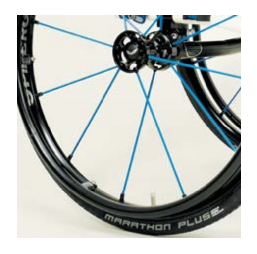
> SPINERGY REAR WHEELS Spinergy wheels with spokes in your favorite color