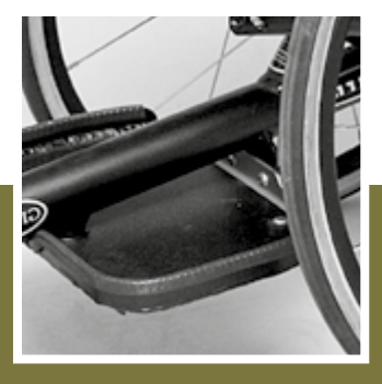
> SOLID FOOTPLATE

The Gitano Junior's design with the centered castor, reduces the rolling and turning resistance significantly.