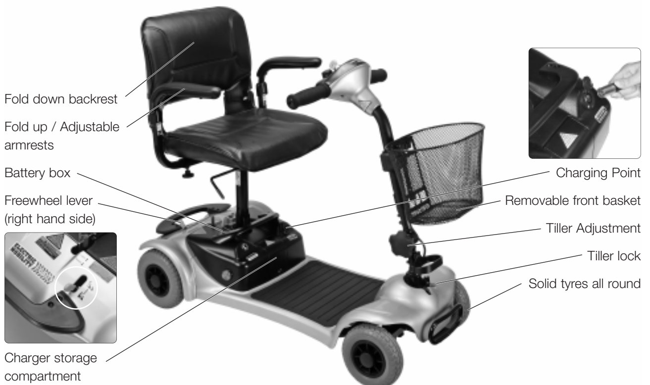
Photo shows UltraLite 480 model scooter. The UltraLite 380 is a 3 wheel version. See the specification for differences.