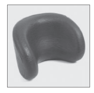
MZ 53 Head support