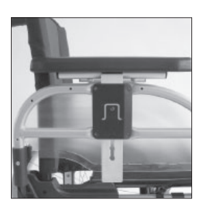
ME 05 Side panel, height-adjustable