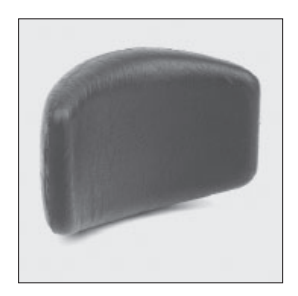
MD 23 Thoracic support