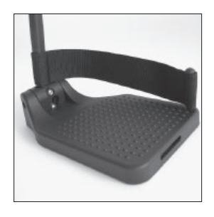
MB 72 Heel strap