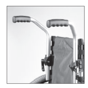
MD 54 Angled push handles