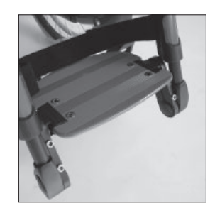
MB 20 Leg support for short lower leg length