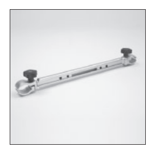
MZ 54 Clinical installation set