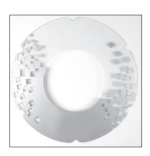
MG 95 Spoke protector with decor