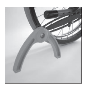
MA 62 Swinging anti-tipper