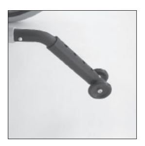
MA 55 Plug-on anti-tipper