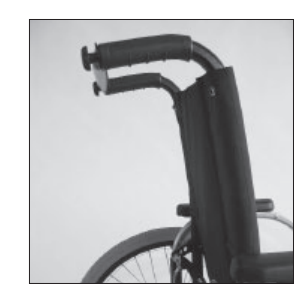
MD 10 Back support angle adjustment 30°