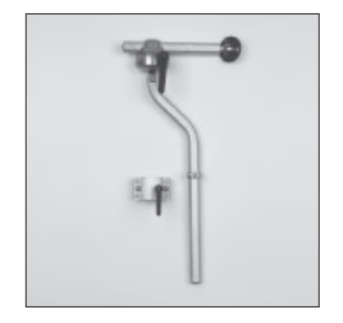
MZ 55 Multi-axis installation set