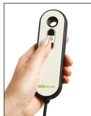
The handset gives the caregiver control over battery-powered functions