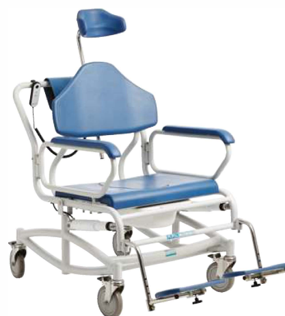
With standard footrests