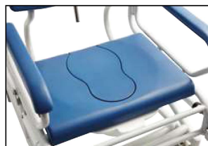
Seat with lid