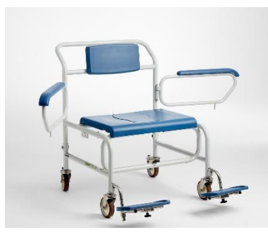
Swing-away arm rests.

When storing the Shower Commode for a longer period (more than three months), store it in 0-40°C and in humidity not exceeding 80%.