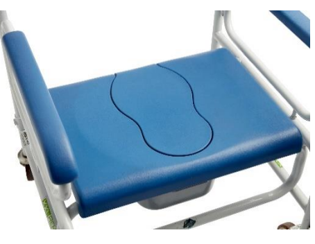
Seat entirely with cover.

Both wheels must be locked with the wheel locks when the user is seated on Shower Commode, except when it is used for transport.