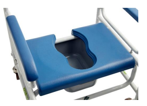
The bedpan is easy to insert and empty.