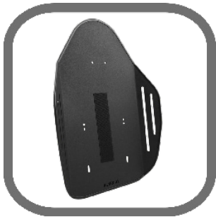
Pre-drilled holes for headrest