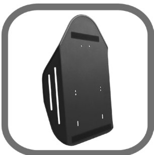
3.5" in height adjustment