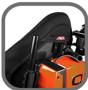
High quality Lycra cover