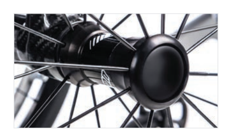
Titanium Axle Pin