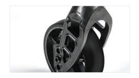
Carbon Composite Castor Forks