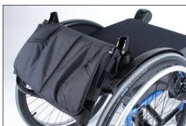
MD11 Foldable back support