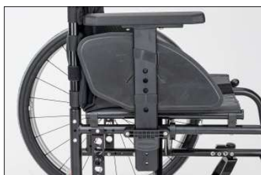
ME11 Plug-on side panel plastic