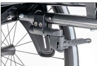
MH05 Outfront-scissor wheel lock