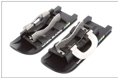
MZ92 Wheel Blades