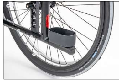
MA57 Crutch holder