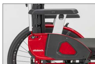
ME17 Side panel with arm support long, height-adjustable