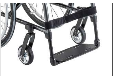
MB03 Single-panel foot plate, angle- adjustable