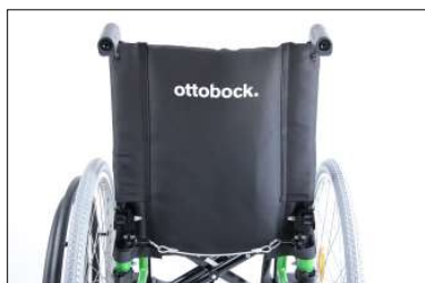
MD04 Back support upholstery Standard