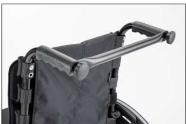
MD58 Stabiliser bar