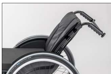
MD10 Back support, angle-adjustable