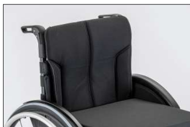
MD03 Back support upholstery, padded