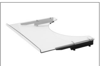
ME60 Therapy tray