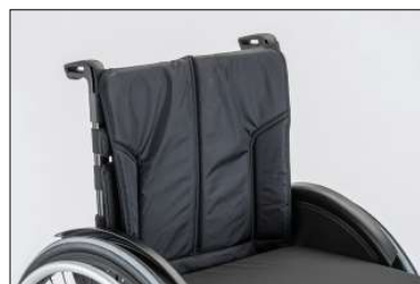
MD05 Back support upholstery, breathable