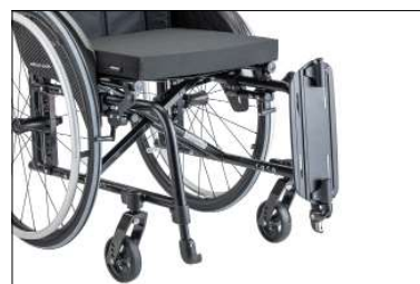
MB201 Foot support bar swing- away, left