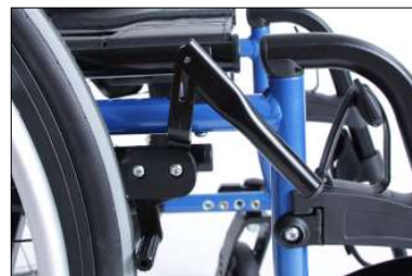
MH10 Knee lever wheel lock extension