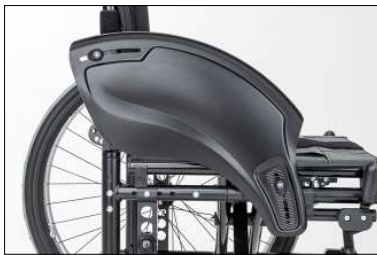
ME02 Side panel with clothing guard and against cold