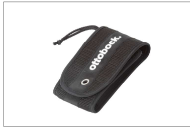
MZ59 Poket for mobile phone