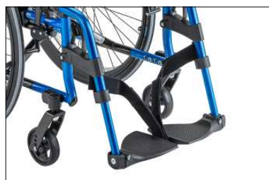
MB10 Leg support, individual, angle- adjustable, swivel up