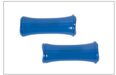
MZ89 Protection for quick-release-axle