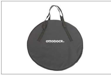
MZ58 Bag for drive wheels