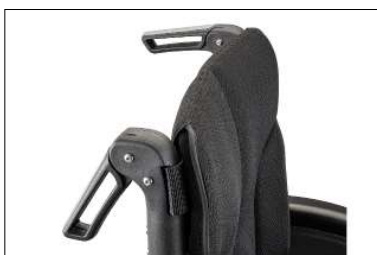
MD56 Push handles foldable