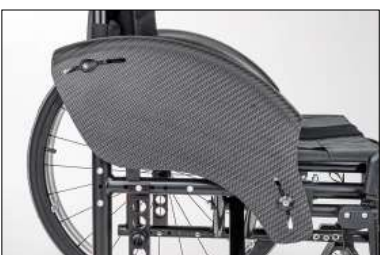
ME04 Carbon side panel