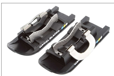
MZ92 Wheel Blades