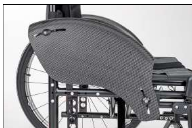
ME04 Carbon side panel