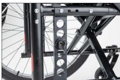
Dirve wheel adapter