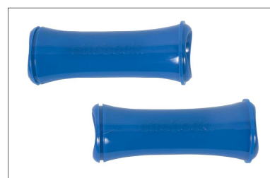
MZ89 Protection for quick-release-axle