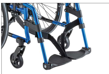
MB10 Leg support, individual, angle-adjustable, flip up