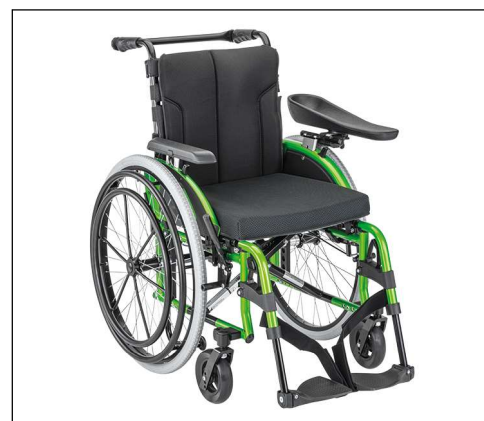
Figure shows additional charge options