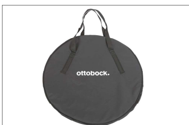
MZ58 Bag for drive wheels