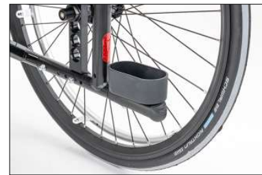
MA57 Crutch holder