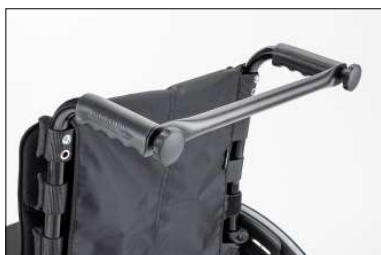
MD58 Stabiliser bar