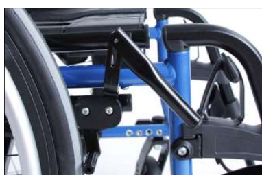
MH10 Knee lever wheel lock extension