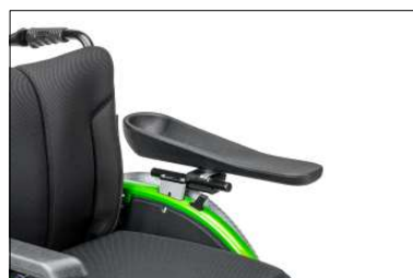
ME70 forearm support, left