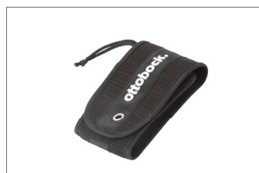
MZ59 Pocket for mobile phone