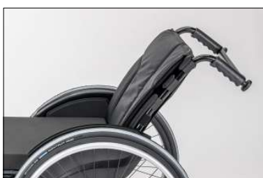
MD10 Back support, angle-adjustable