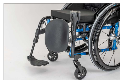
MB22 Amputation leg support, left