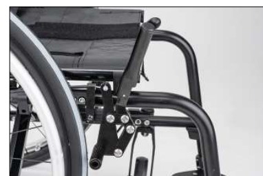
MH08 Knee lever wheel lock for one-hand activated