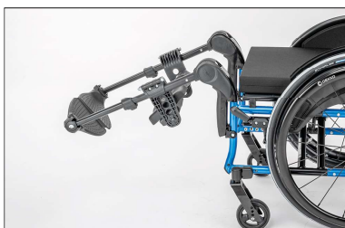
MB25 Leg supports, elevating