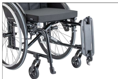
MB201 Foot support bar swing-away, left