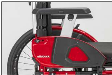
ME17 Side panel with arm support long, height-adjustable