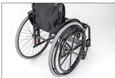
MG83 One-arm drive wheel with double handrim, right