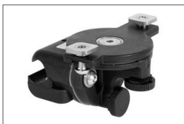
ME61 Elevating swivel unit for fore- arm support