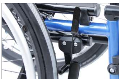
MH01 Knee lever wheel lock