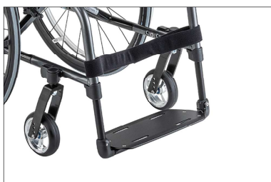
MB03 Single-panel foot plate, angle-adjustable