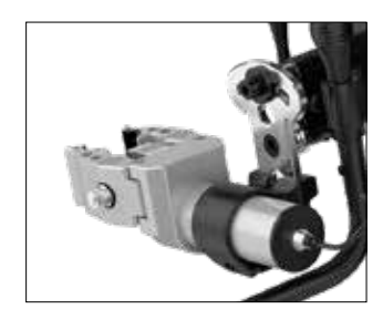
Automatic Easy Clamps for effortless engaging