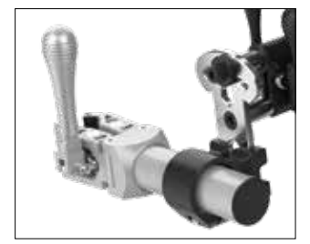
Manual Easy Clamps with long levers for easy engaging

It is very easy to connect the PAWS to the wheelchair, with two innovative choices of Easy Clamps - Manual or Automatic. Another unique feature of the PAWS is that you do not need any wheelchair modifications or add-ons to connect both. After using PAWS, your wheelchair remains as it is. All you add is PAWS!