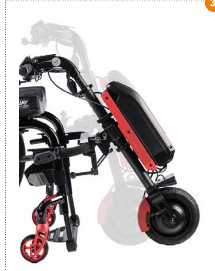
Step 3 - Turn the locking pin and with either one or two hands push the bike up until you hear a click