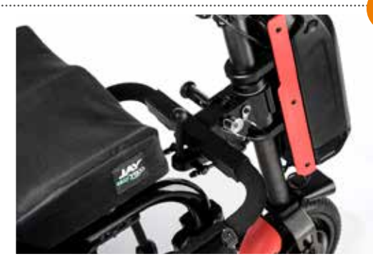
Step 4 - Lift the clamp to remove the play between the bike and the chair for a smoother ride

Once docked the F55 is light to push up, lifting the front castors off the ground. Ideal even with limited strength.