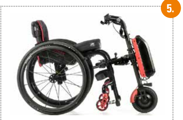
Step 5 - Once mounted simply turn the F55 on and off you go!

The lift clamp is designed to reduce the play that exists between a chair and an add-on device, meaning you can feel safe and secure in your F55.