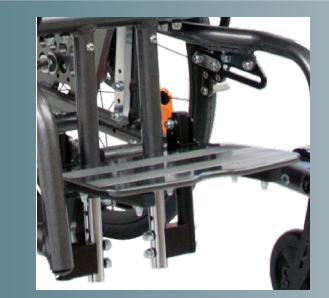
Dynamic and sprung leg rest