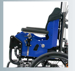
Ergonomic seat and back