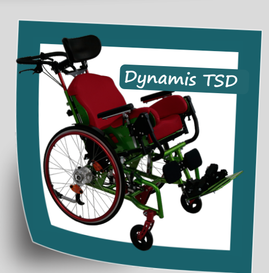
The dynamic tilting wheelchair