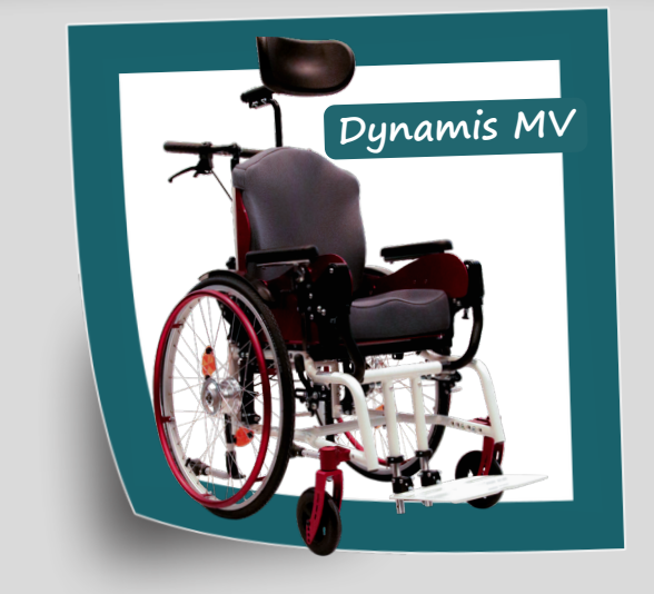
The dynamic activ wheelchair