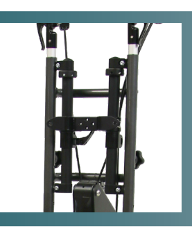
Back guide with adapter for adding a seat shell system