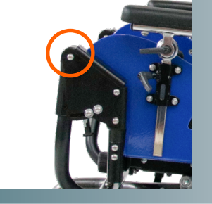
and much moro...