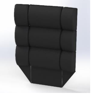
The back cushion is made up of nine modules sewn into one large cushion.