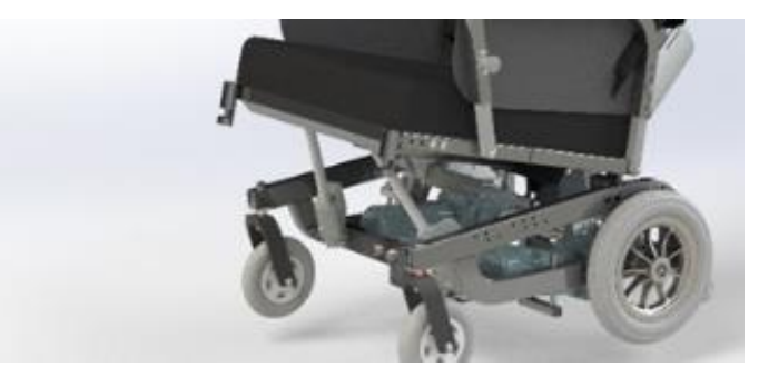
The leg rests can be dismantled without using tools.