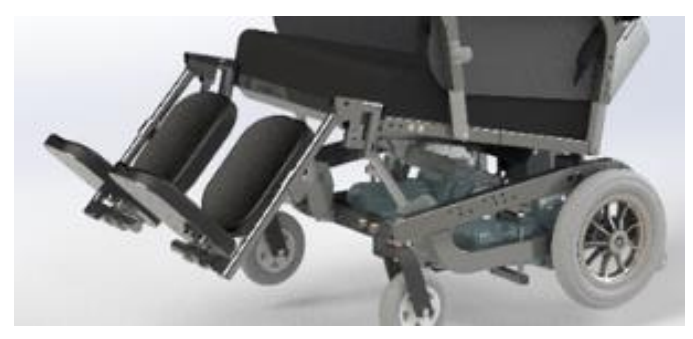
Leg rests each supporting up to 200 kg.

The leg rests may be removed without the use of tools without affecting stability.