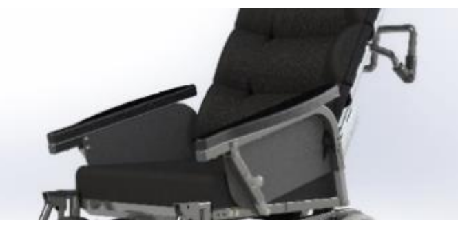
Swiveling arm rests allow positioning near table.