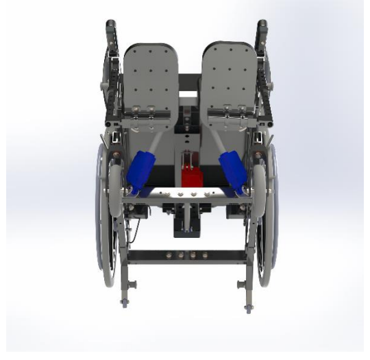
Two actuators (marked blue) control the tilt-in-space function. One actuator (red) controls the recline function.