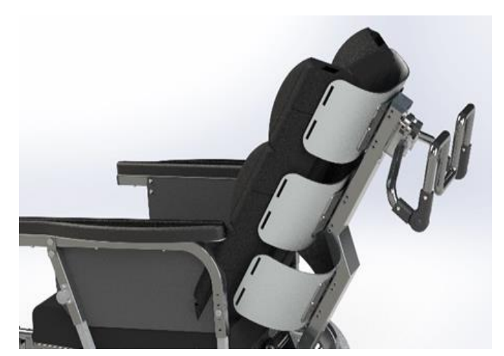
Curved plates hug and support the user from buttocks to neck.

The modular cushion can be finely adjusted using a patented FitGo system known from ski boots and work shoes. The FitGo system is located on the back plates.