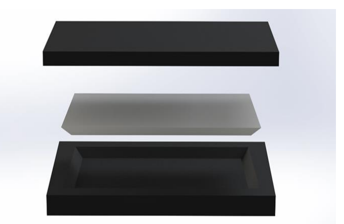
The seat cushion is made up of three different types of foam.

The armrests are padded for extra comfort and "cup-shaped" thus reducing the risk of pressure ulcers. Each armrest can withstand a maximum load of up to 200 kg.