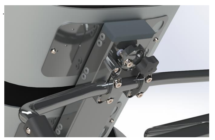
A universal neck support bracket permits the installation of several types of neck supports.

The electronics of the wheelchair does not disturb the operation of units in the surrounding environment which emit electromagnetic fields, e.g., alarm systems in shops, automated doors, etc.