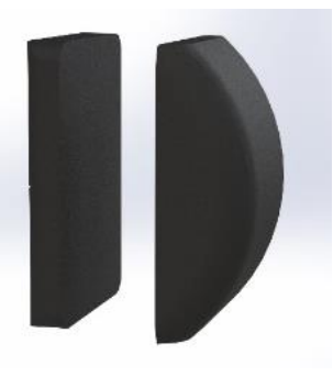
Each module consists of a firm foam layer and a layer of beads and latex foam.